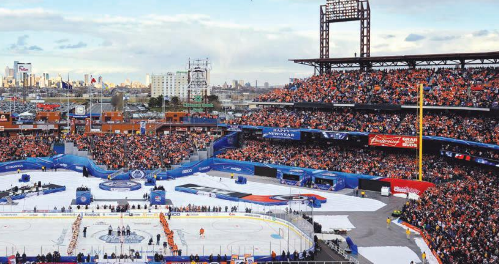
The National Hockey League's Winter Classic held at Citizens Bank Park in Philadelphia is one of many major events the state has successfully hosted.

There are many reasons the City of Brotherly Love had such a successful tourism year, but sports, and the National Football League, in particular, played a major role. In 2017, Philadelphia hosted the NFL draft for the first time since 1961 and it resulted in a $95-million economic impact for the city. A report published by Visit Philadelphia in partnership with Temple University's Sport Industry Research Center, found that 250,000 people visited Philadelphia for the Draft and the three days of events that coincided with it, resulting in 18,991 hotel room nights being booked. The Draft attracted attendees from 42 different states, with 92 percent of those saying the Draft was their sole purpose for visiting.