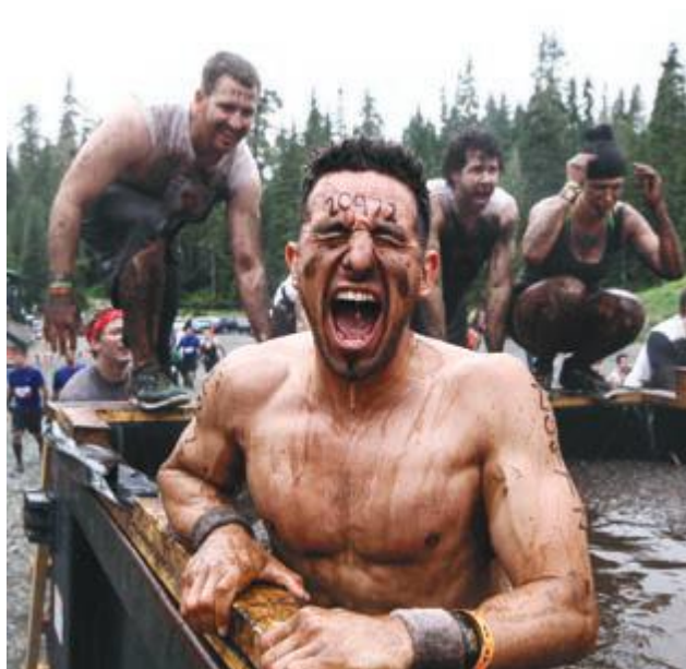
The Tough Mudder event is held in Chester County.

From those humble beginnings grew an institution that has helped turn Pennsylvania into one of the country's most desirable tourism locales, bringing the state major national and international exposure along with an infusion of capital. In recent years alone, Pennsylvania has hosted a slew of high-profile events, including the 2017 NFL Draft in Philadelphia,